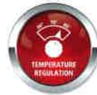
TEMPERATURE REGULATOR KNOB