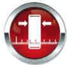
SLIM, ELEGANT & SPACE SAVING DESIGN