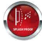
PROTECTION FROM WATER SPLASH (IPX1)