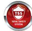
TOTAL SAFETY SYSTEM