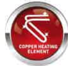
DURABLE COPPER HEATING ELEMENT