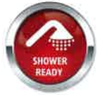
SHOWER READY CONTROLLED BLUE INDICATOR